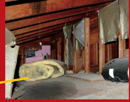
Leakage in attic after driving rain. Possible causes: Leaky or inadequate shingle underlayment; deteriorated flashing